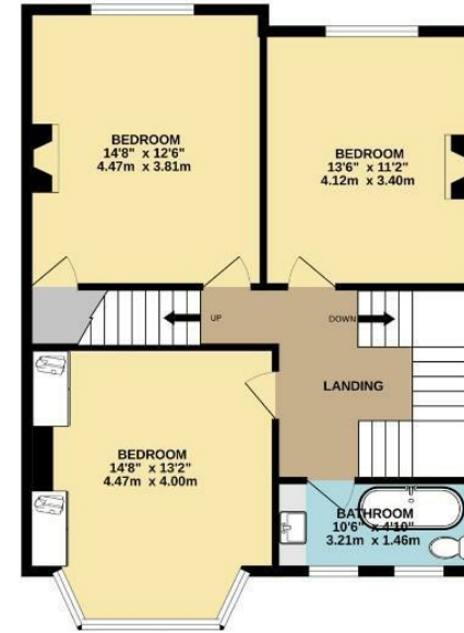
1ST FLOOR 715 sq.ft. (66.4 sq.m.) approx.