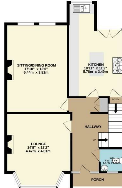
GROUND FLOOR 775 sq.ft. (72.0 sq.m.) approx.